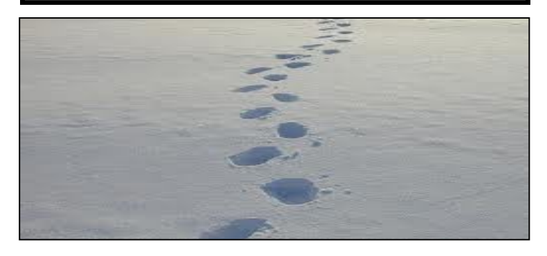
~Everything Depends on Your Steps~

The seed of mindfulness is in each of us, but we usually forget to water it.